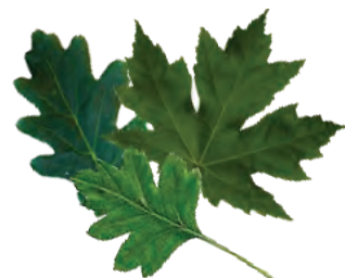
3 different leaves