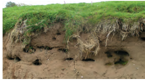
Places for wildlife to hide