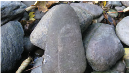
Small rocks or pebbles