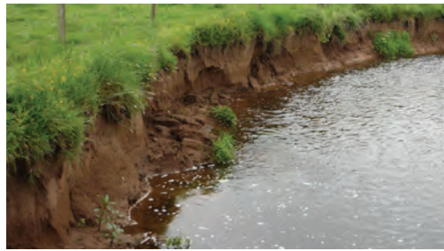
An eroded river bank