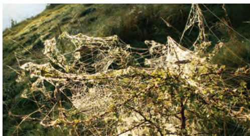
A spider web