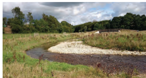
A bend in the river