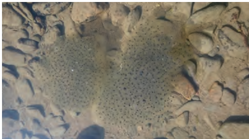
Frog or toad spawn