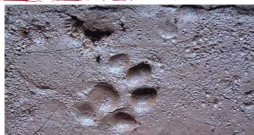
Animal tracks or signs