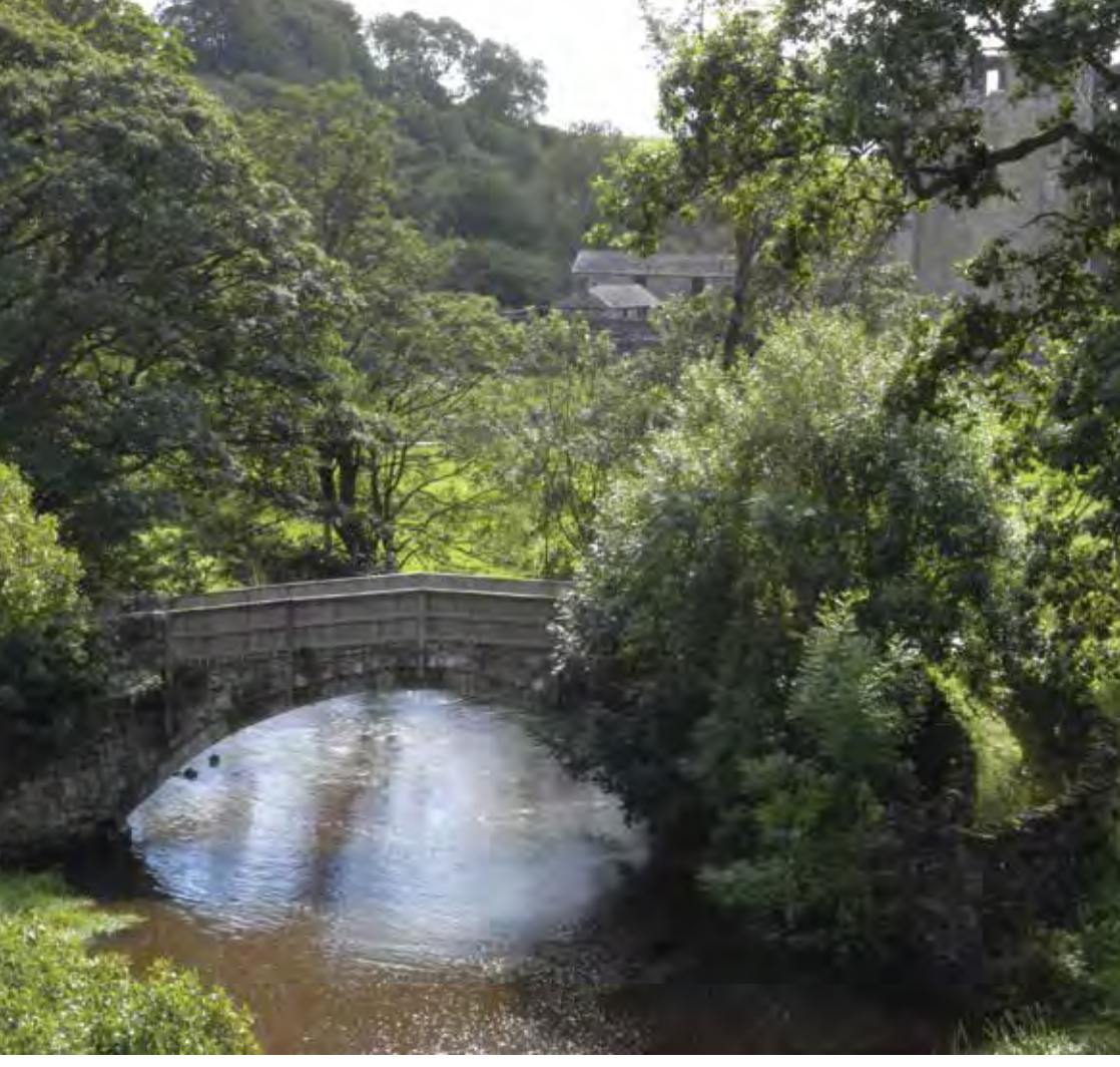
bridge over river Lowther near Shap Abbey

Follow the track past the timber bungalow on your left and go straight up the rough bank from the point where the main track goes off to the left. A way-marker post at the top of the bank shows the way. Turn right at the top of the bank, go over a wall-stile beside a field gate and continue alongside the fence on your right, where the footpath follows the top side of Shap Abbey Woods.