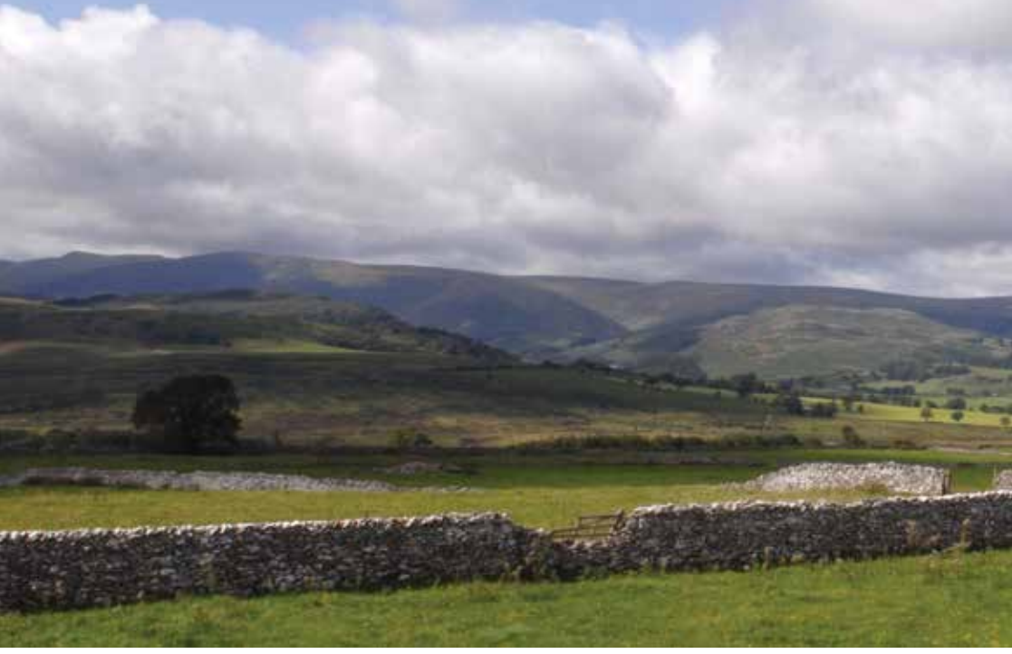
view towards the Lake District

Although the Shap area is now dominated on its eastern side by the motorway, there is a tranquil area to the west where a beautiful ancient landscape leads across to the Lake District.