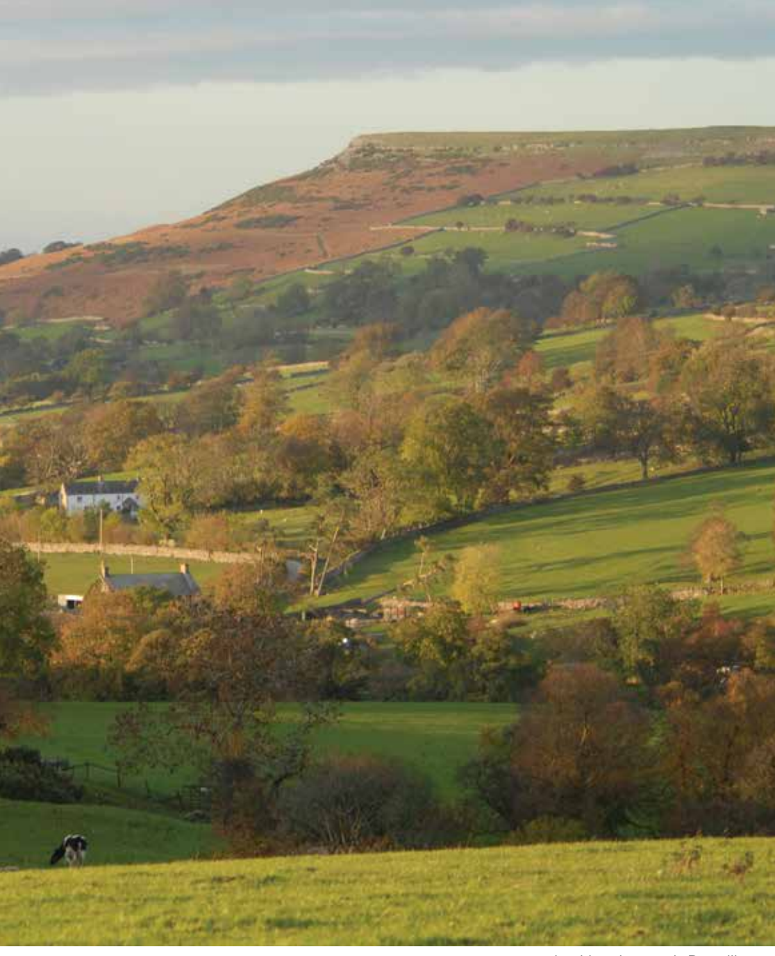
looking towards Rosgill